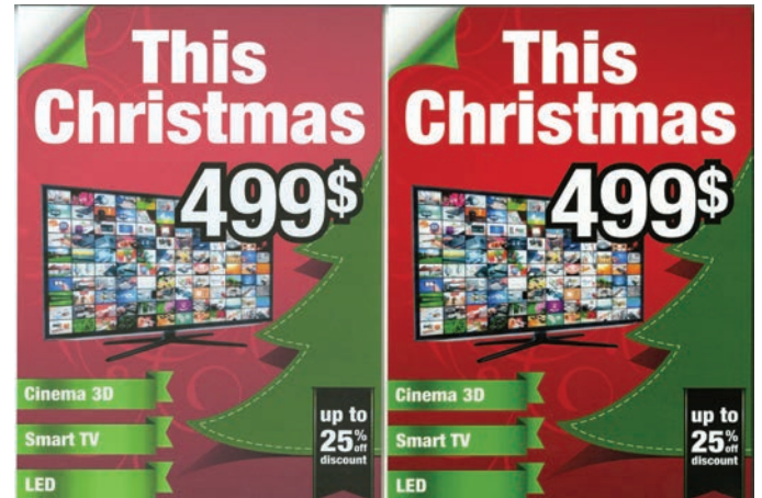
Photo of FOME-COR SIRIUS (right) and an alternative, uncoated foam board (left) printed on the PageWide XL Pro