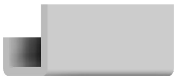
Double Fold 90°/90°

Using the available attachment system, simply insert the panels with short clips or with a continuous rail. Clips are available in 3" lengths and rails are available in 12' lengths.