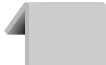
Single Fold 135°