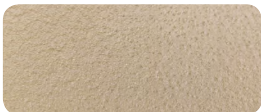
NEW! SIERRA SAND