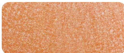
NEW! TERRA COTTA