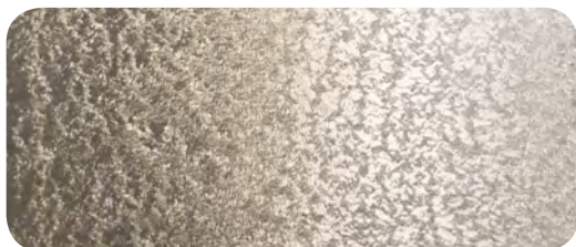
NEW! CLEAR ICE