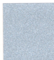
BRILLIANT SILVER METALLIC PVDF 3/SRI 73