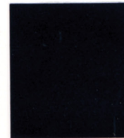
FOCUS BLACK II PVDF 3/SRI 30