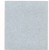
CHAMPAGNE METALLIC PVDF 3