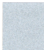
SUNRISE SILVER METALLIC II PVDF 3/SRI 30