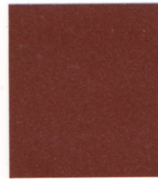
RUSSET MICA PVDF 3/SRI 38