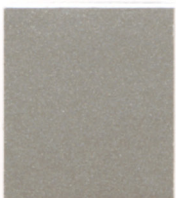
HARVEST GOLD MICA PVDF 2