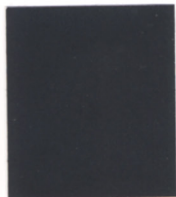
DUSTY CHARCOAL PVDF 3