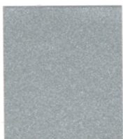
WEST PEWTER MICA II PVDF 2