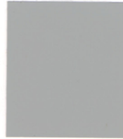
CADET GRAY PVDF 2/SRI 51