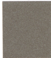
DRIFTWOOD MICA PVDF 2/SRI 40