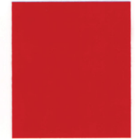
PATRIOT RED PVDF 3