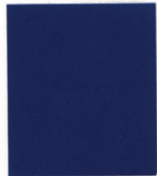
AZURE BLUE PVDF 3