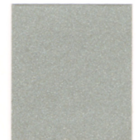
ANODIC SATIN MICA PVDF 2