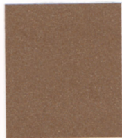
HAZELNUT MICA PVDF 2/SRI 40