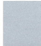
PLATINUM MICA PVDF 2/SRI 61